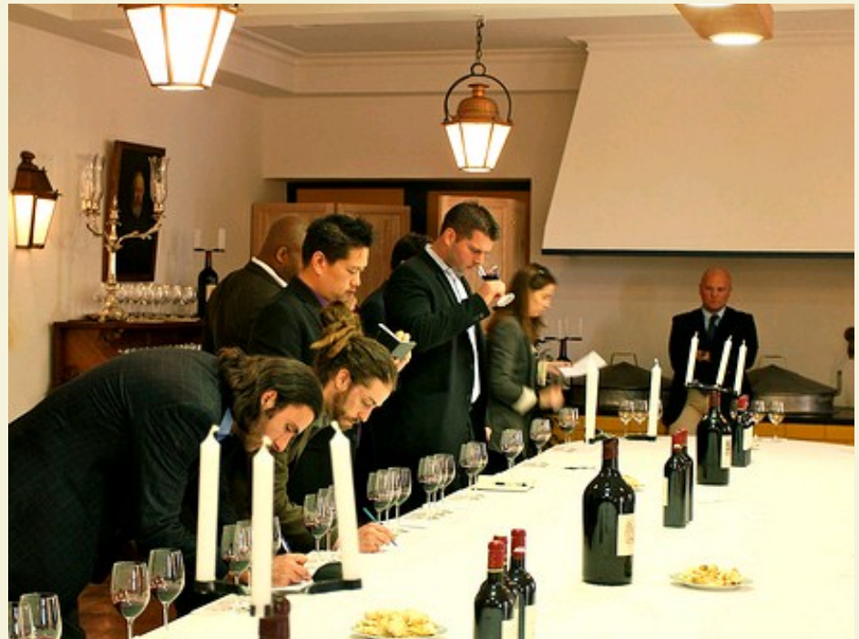
At Chateau Lafite, April 2012

At a more detailed level, it is essential to look at acidity levels as well as the amount and shape of the tannins. Wines can seem lean due to excessive acidity while some may seem in need of more acid to avoid being ponderous and 'heavy'. In terms of tannins, some wines may show an abundance at this stage, but we're looking for those that are finely textured and pleasant rather than spiky and rough. As the finished wines will be judged on these important qualities, winemakers can adjust some of these factors before bottling if they feel it's necessary.