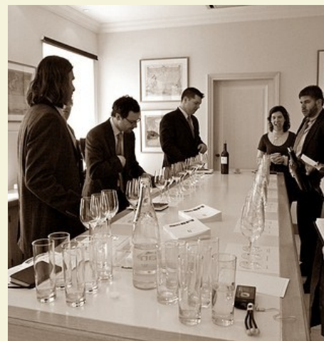
Chateau Latour, April 2012