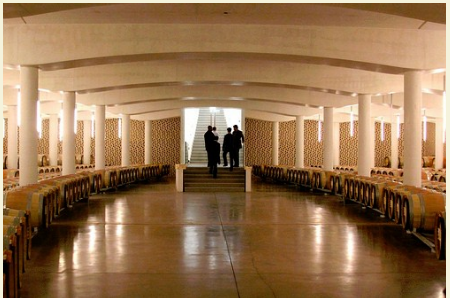
Cheval Blanc, April 2012

If compared to another vintage, 2011 is somewhat similar to 2001. It, too, followed a great vintage (2000), and if you ask anybody in Bordeaux what they are drinking and enjoying today, they will tell you 2001.