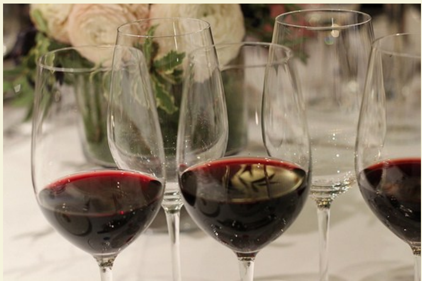
Comparing wines at dinner, April 2012