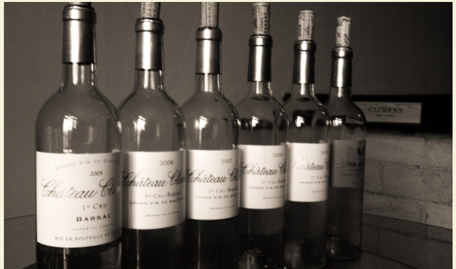
The line-up of Chateau Climens

All these efforts are well intentioned and in some cases show clever, out of the box thinking. But like many similar efforts to revive such moribund wine sectors as port or Madeira, they will have some impact on the margins but cannot steer the entire region to new levels of success. And for good reason, because they do not speak to the essence of Sauternes—its rich history, the sheer fortune that brings the fog and mists, ugly molds, and mature grapes together, let alone the unique flavors that are almost otherworldly and unmatched by other regions. These are just a few of the reasons that Sauternes has maintained its place as one of the world's great wines, and no amount of marketing can change that. Celebrating the special place of Sauternes in the firmament of the wine industry and letting its wines speak to what the region is all about is the story that will ultimately resonate. With some great vintages in the hopper, this seems to be the time to let the wines do the talking.