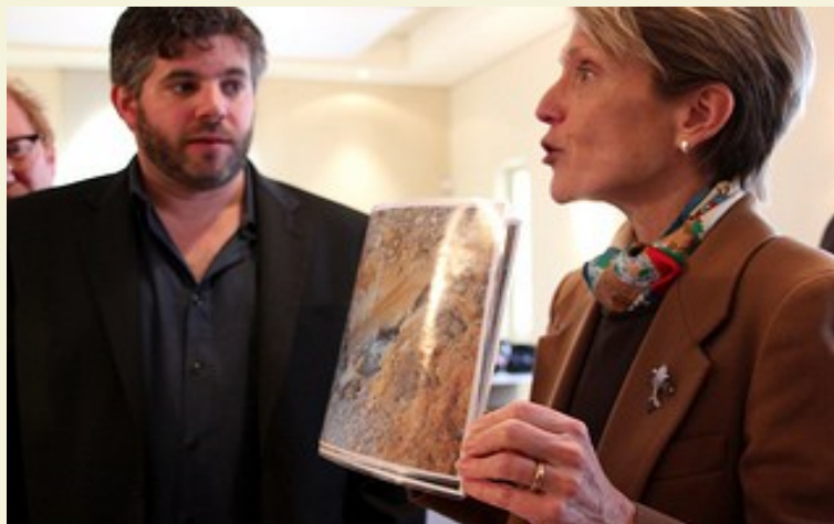
Soil education at Chateau Petrus, April 2012

On the other hand, the extended warm temperatures and dry conditions that lasted on through October allowed those chateaux who waited out the storms to harvest perfectly ripe fruit. Cabernet franc was a big benefactor of the more moderate weather, with many Right Bank estates picking their best grapes ever. But, those properties who let the fruit hang a bit too long made some overripe wines, lacking in freshness and vibrancy.