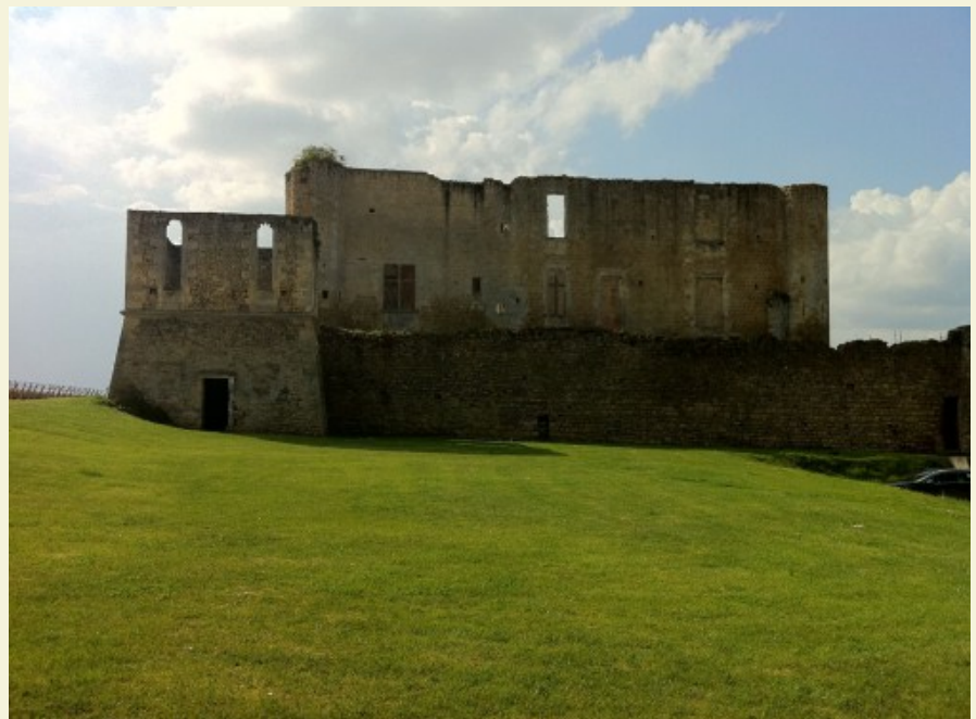
Castle ruins at Chateau de Fargues, April 2012.

out some efforts from the world of packaging and marketing. The theory is that classically styled labels don't resonate with younger audiences so contemporary designs are necessary to bring in new consumers. A few wineries are thinking about smaller sizes such as a 187ml bottle to get the wine into more hands in more places. Chateau Giraud came up with a very interesting and clever concept, a three vintage vertical e of its Sauternes in 100ml tubes that are sold to retailers and potentially to night-clubs. The package is quite impressive, with an appearance more akin to a shampoo product. But in the end, whether new packaging or innovative wine styles can save Sauternes is still a matter for debate.