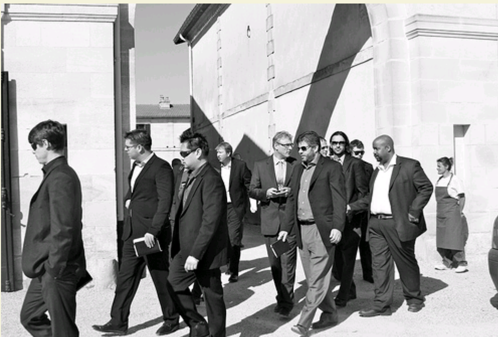
At Chateau Pontet-Canet, April 2012

As in previous years, our offices in Oakland took on an eerie silence as our team of wine specialists departed en masse to Bordeaux. Our schedule was packed with chateau visits, tastings, and dinners all the while trying to maintain business as usual for our customers back home. As JJ Buckley's team of wine specialists has grown significantly over the past year, we were able to attend more of the critical events of en primeurs week, giving us both a broad and in-depth assessment of the vintage that is rivaled by few other retailers anywhere in the world. Each and every tasting is rigorously analyzed and debated as we slowly build a consensus on the vintage's specific attributes while selecting our top picks.