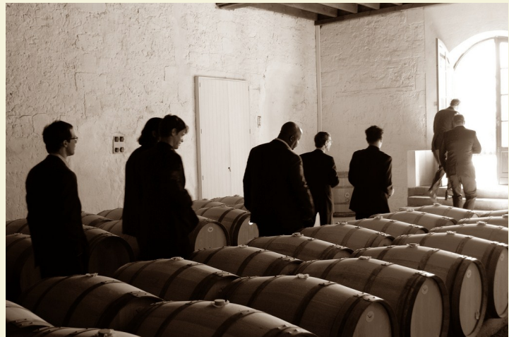
Chateau Palmer, April 2012

JJ Buckley offers on-site storage as well as access to resale services. Please contact one of our Fine Wine Specialists by phone for more information.