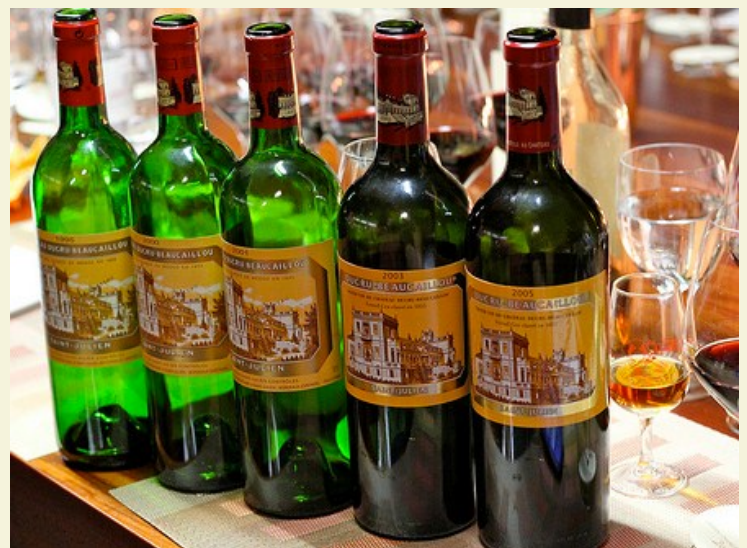
Dead soldiers at Ducru Beaucaillou, April 2012