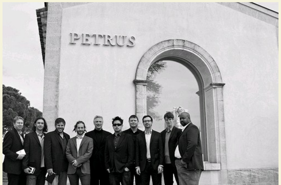
Some of the team outside Chateau Petrus, April 2012.