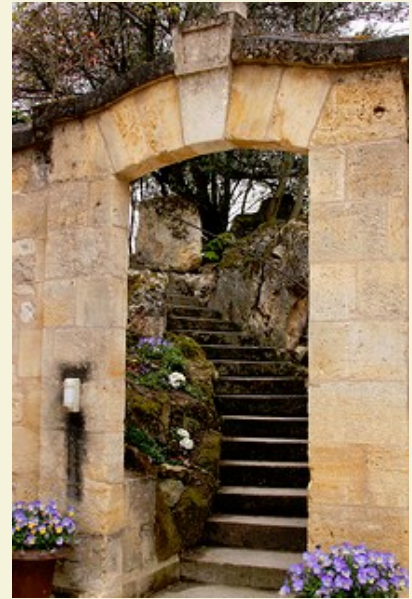
Chateau Ausone, April 2012

Given the current appetite of the market following the 2009 and 2010 vintages, our intention is to offer our clients the best possible pricing, a complete selection of the top wines of the vintage, in-depth wine-specific analysis, and our 60% deposit-only option. We hope that with this combination, the consumer will be able to make sound and educated buying decisions.