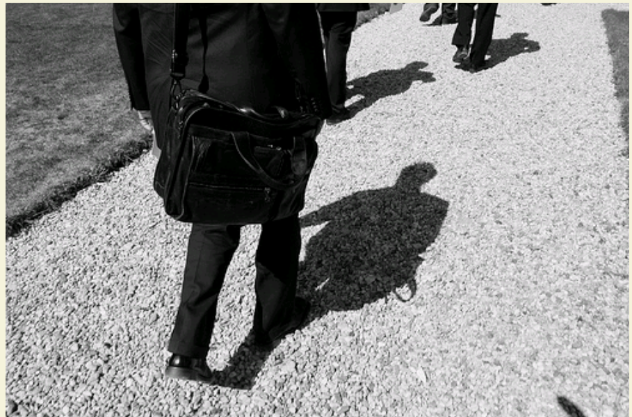
Crunch of gravel underfoot on the walkway at Chateau Lafite, April 2012

And while there was (yet again) never-ending discussion about the potential of the Chinese market, it seems to us the key word here is still 'potential'. We encountered fewer members of the Chinese wine trade than in previous years. And while no one doubts Bordeaux will play an important role in the Chinese trade at some point, we predict that only a few select estates will see much action in this campaign.