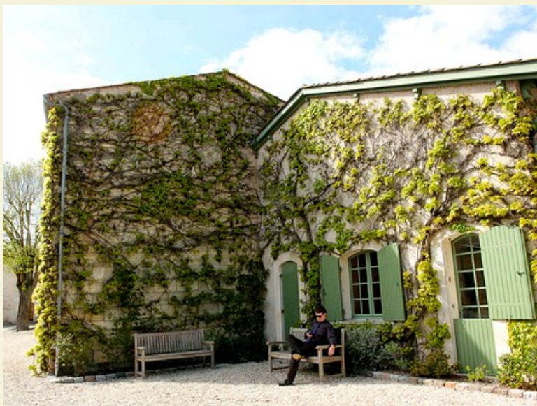
Taking a break at Chateau Palmer

In reality, most of the actual business of Bordeaux is transacted behind closed doors at negociant offices and warehouses that the public rarely sees. As they have for centuries, negociants play a vital role in the Bordeaux wine market, acting as middlemen between the chateaux and the marketplace. There's nothing particularly romantic about these strictly business affairs, which take place in rather sterile, brightly-lit offices lined with endless rows of bottles to be tasted. But they do offer some privacy and quiet, which makes it easier to focus on the task at hand.