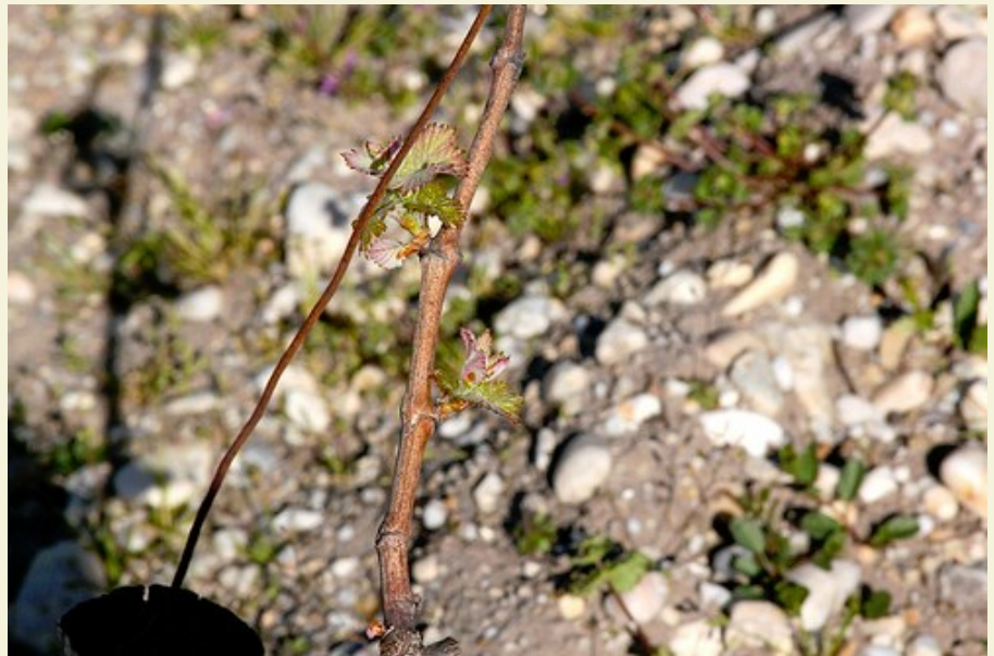
Bud-break at Chateau Latour, April 2012

The weather, however, blessed many growers with perfect, warm temperatures for the rest of September, thus giving those grapes left on the vine the boost necessary for their final phases of maturity. With only a few sprinkles in the middle of the month to deal with, wineries were able to bring in their fruit and assess the impact of the previous months' weather. Much of the vintage's quality was heavily dependent on the sorting table, where drought affected fruit was discarded along with those showing signs of rot and mold. With the grapes in the tanks, the harvest was now in the hands of the winemaker.