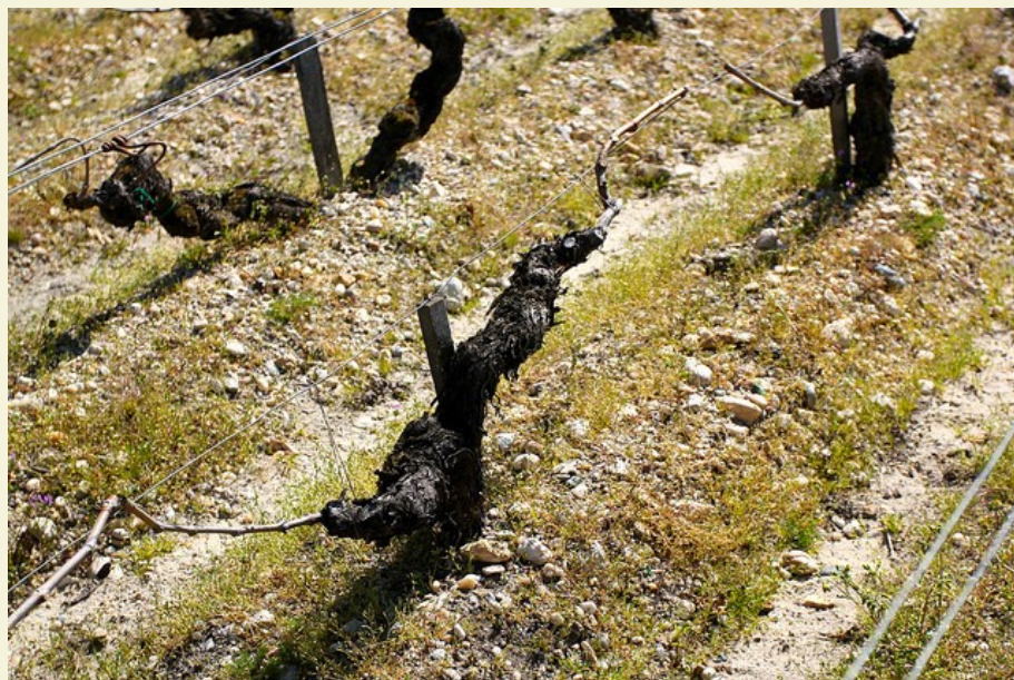
Vines at Chateau Lafite, April 2012