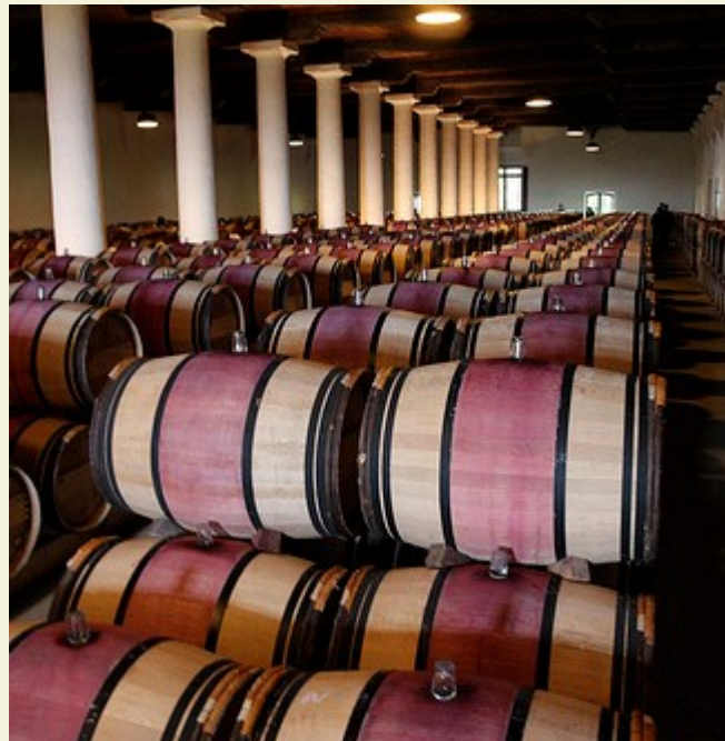
In the chai at Chateau Margaux, April 2012

This innovative payment option is just one part of our continuing commitment to offer the best possible advantages in choosing JJ Buckley as a retail partner. As far as we know, no other retailer in America is offering such an opportunity to their Bordeaux futures customers.