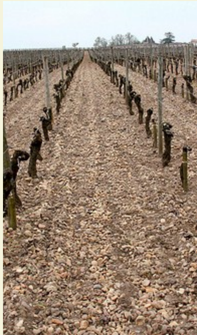
Soils at Ch. Lafleur, April 2012

In 2011, grapes grown on gravelly soils suffered the most and this is where the Left Bank was at a disadvantage. Cabernet sauvignon and cabernet franc are frequently planted in gravel. Poor in nutrients, gravel soil helps tame the vigorous nature of these vines. However, the inability of gravelly sites to retain water placed inordinate stress on those vines during the drought. In addition, gravel reflects and retains heat, adding further stress to a thirsty vine. Younger vines, with their shallow root systems, also suffered in 2011.