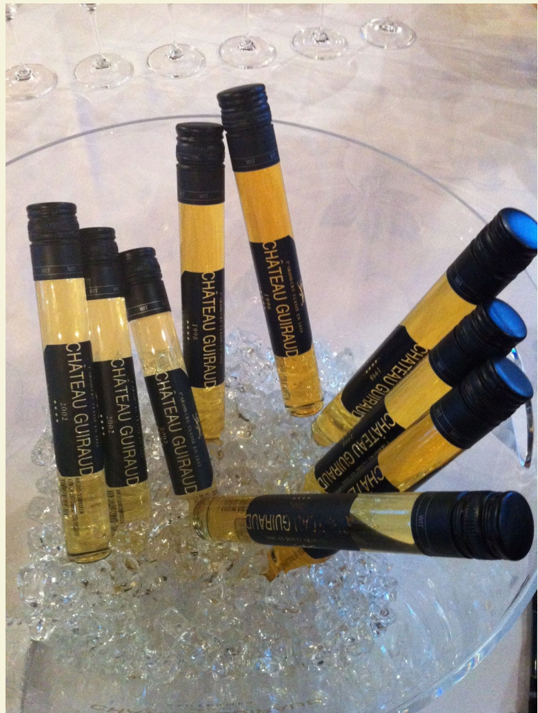
100ml tubes of Chateau Guiraud

leaving breathtaking impressions that stand in sharp contrast to the more rural, down home feel of Barsac.