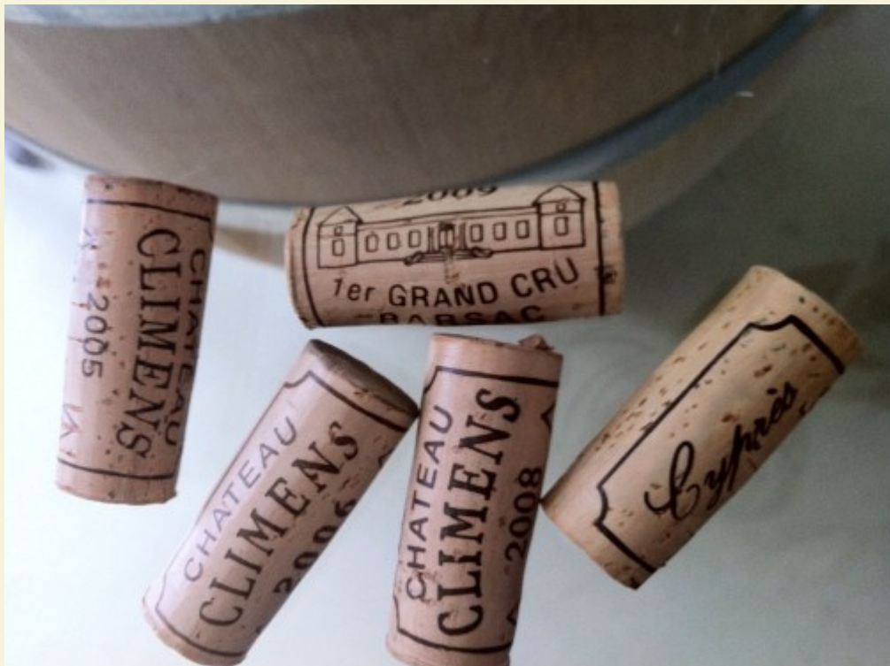
Corks from a Climens vertical tasting.

However, these wines run the risk of drying out and losing freshness along with their purity of fruit. Wines past 15-20 years old seem to be most at risk for losing many of their youthful qualities. The best examples highlight advanced flavors of dried apricot and peach, notes of molasses, and crème caramel. At the same time, textures spread across the palate, extending their presence on the back end with a full, creamy finish the order of the day.