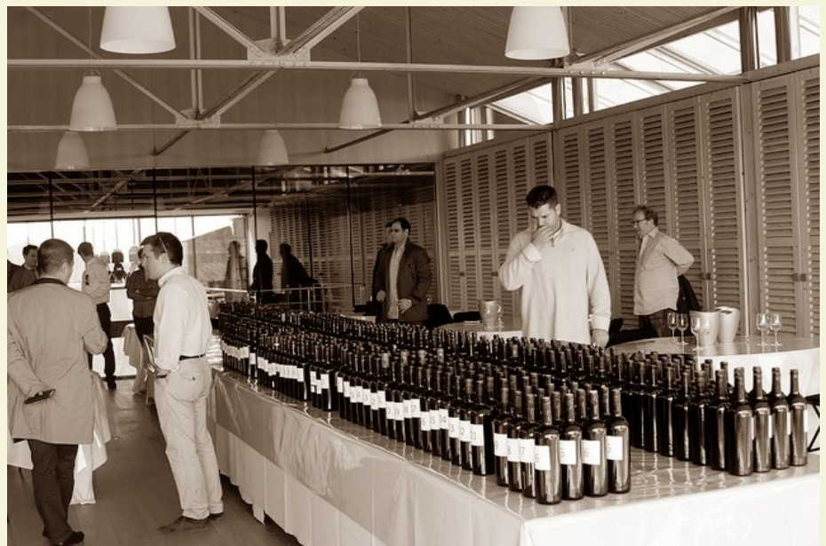
Knowing where to start is half the battle. UGC event hosted at Barde-Haut, April 2012

The weather and time of day can also influence how a wine tastes considerably. There are noticeable differences between identical wines tasted on sunny versus cloudy days and wines tasted early morning, when both you and your palate are alert and fresh, versus later in the day when you are staring down sample bottle #186. With so many factors affecting how a wine can taste on any given day, the best option for getting an accurate understanding of a particular wine is to taste and re-taste as much as possible over the course of the week.