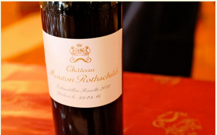
Chateau Mouton-Rothschild 2011

Last, the world financial markets remain unstable, with much volatility and uncertainty and the top end of the Bordeaux market is not immune to shifts in economic fortunes. China remains a big question mark, with the potential to move prices of entire vintages, depending on appetite. It remains to be seen, if China will continue to quench their thirst with Lafite, or if they will find a new flavor of the day. Regardless, they have the ability to move markets, as they did in 2009 and 2010. While demand subsided in 2011, it can return at any time.