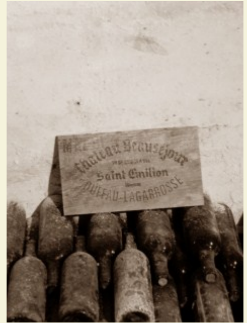
The cellar at Beausejour-Duffau, Apr '12

To better understand the value proposition of the current vintage, it helps to have some perspective by taking a look back at other vintages of similar quality. The price of the current vintage, in this case 2011, needs to be at least competitive with current market prices for vintages of similar quality. Preferably, priced even lower.