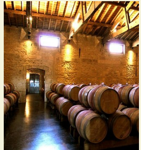
Pontet-Canet, April 2012

The center of the Haut Medoc, in St. Julien and Pauillac, frequently fares the best in difficult years. (There's a reason the First Growths are clustered here!) But the variable quality of the vintage was also seen in these two communes. Here, the leafy, herbal character was not as apparent as elsewhere. Instead, there was a preponderance of imbalanced wines, with hollow mid-palates and austere tannins. Those that kept acids and tannins in check while maximizing fresh fruit made great wines. We found Lafite in Pauillac, and Ducru Beaucaillou in St. Julien, to be among the very best from the Left.