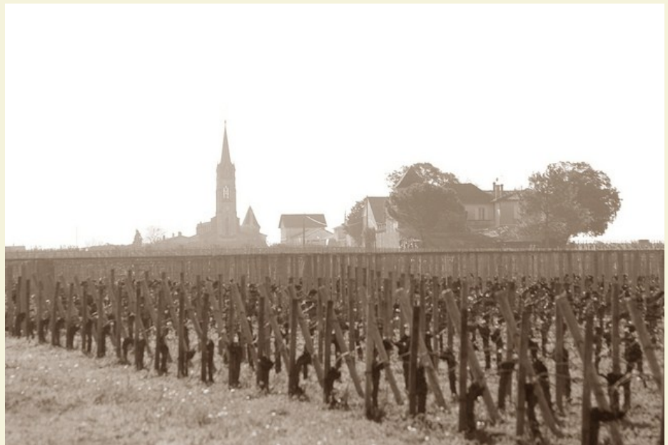
Vineyard view at Feytit-Clinet, April 2012

It's not easy to sum up the 2011 harvest in a simple manner given the wide range in quality, the unusual growing conditions, and Bordeaux's increasing ability to adapt to adversity both technologically, and financially. As mentioned earlier, it wasn't that long ago that a year like 2011 would have been a disaster. But with the advancements made in the last 10-15 years, this is a much better vintage than we anticipated, with many very attractive, even exciting, wines to be had. This is a year where the Bordeaux drinker is to be celebrated, a year where there are many enjoyable wines suited for the table, and not the auction house.