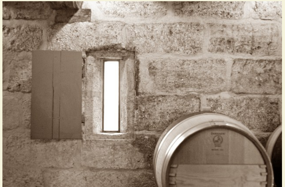
Barrel room at Lafleur, April 2012

The nature of Pomerol's rise has also contributed to its image of an insider's region. Since it is relatively new and has no formal classification, the consumer has to learn a bit more about the area and actively seek out the wines of these small producers. This mystique has only added to Pomerol's allure, where having some inside information may help discover the region's next new star. It is a pursuit that will become increasingly important as the global demand for Pomerol continues to rise.